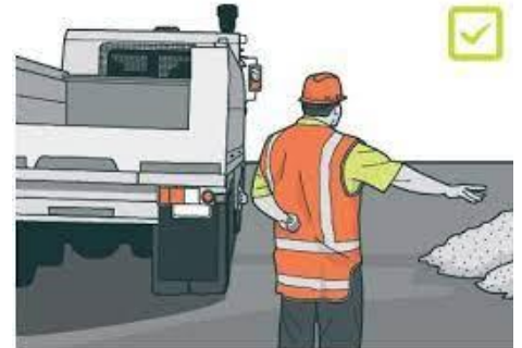
A safety observer

Safety Observer is a worker with line of sight who helps direct the operator with safe movement of mobile plant in the workplace, including loading and unloading from transport, but is not necessarily qualified to guide movement in proximity to overhead powerlines.