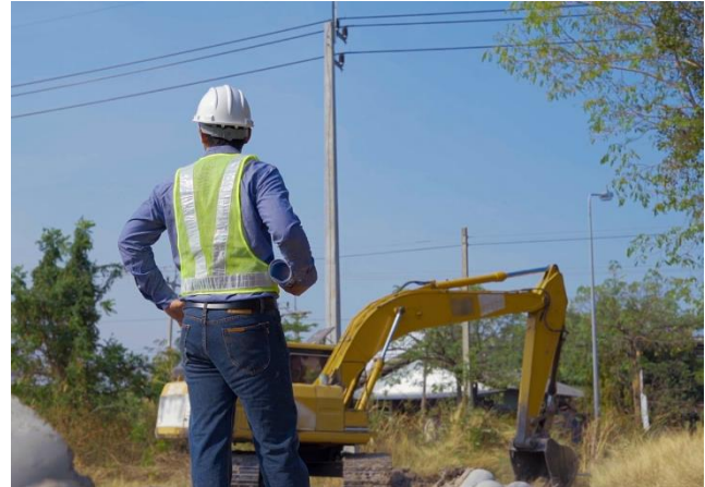
An Electrical Spotter

In order to remember which term is which, get used to using the terms: