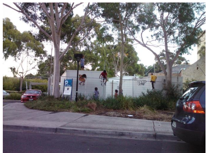
Children climbing fence